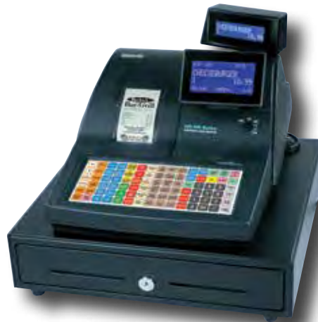
NR-510 Flat, Spill-Resistant Keyboard