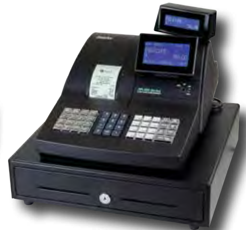
NR-510R Raised-Key Keyboard