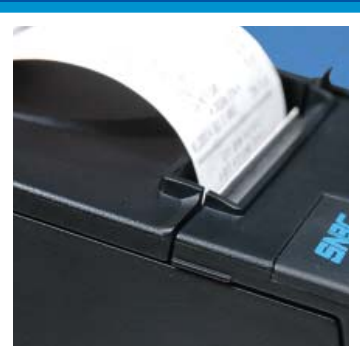
Liquid Guard Built Into the Cabinet Design