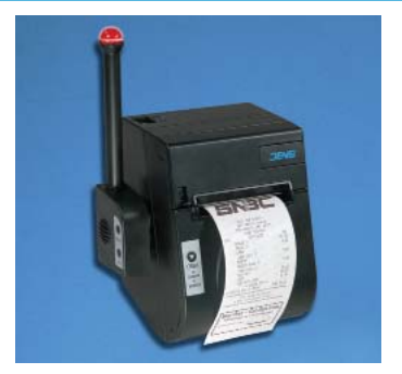
Built-In Wall Mount Capability and Optional Audio/Visual Print Messenger