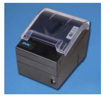
Optional Spill Cover