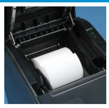
Drop and Print Paper Loading. Included Paper Width Selectors Allow 58mm Paper Rolls