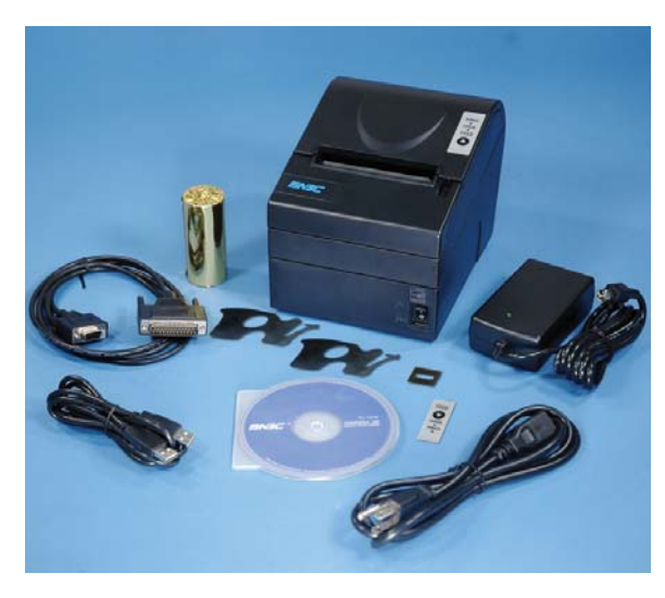
Contains Everything Necessary – Including the Communications Cables – in the Carton