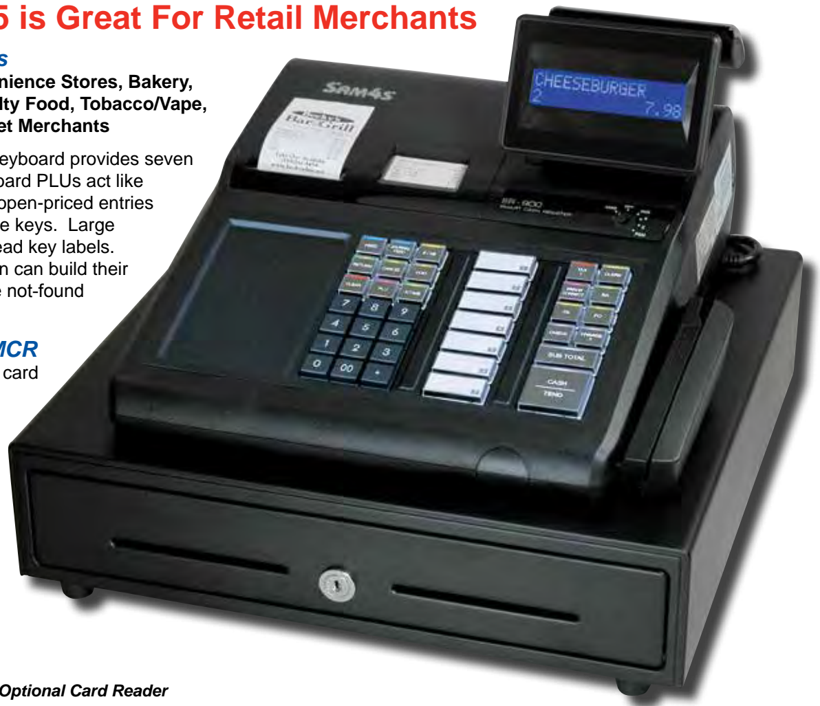
SAM4s ER-915 Shown With Optional Card Reader

Use the optional integrated card reader to swipe payment cards when integrated payment options are implemented.