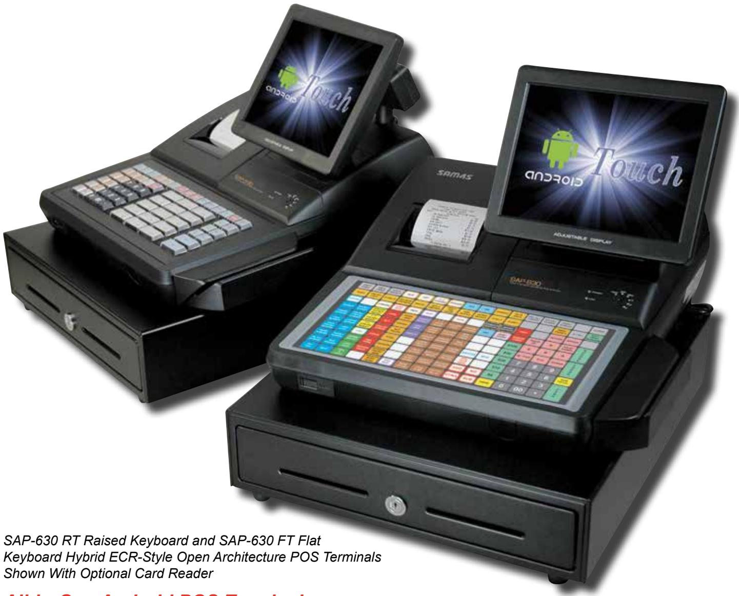
SAP-630 RT Raised Keyboard and SAP-630 FT Flat Keyboard Hybrid ECR-Style Open Architecture POS Terminals Shown With Optional Card Reader

Hybrid ECR-Style Open Architecture POS Terminals