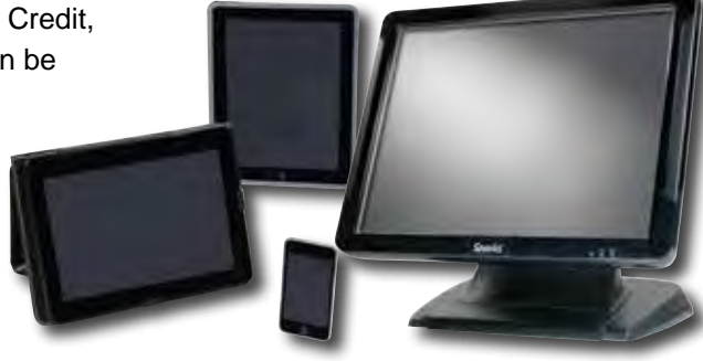
Deploy up to eight POS devices.

You can select a specific customer at the time of sale so that you can track sales levels. You can view either revenue or entire receipts.