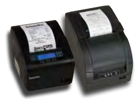
Deploy up to four transaction or kitchen printers.