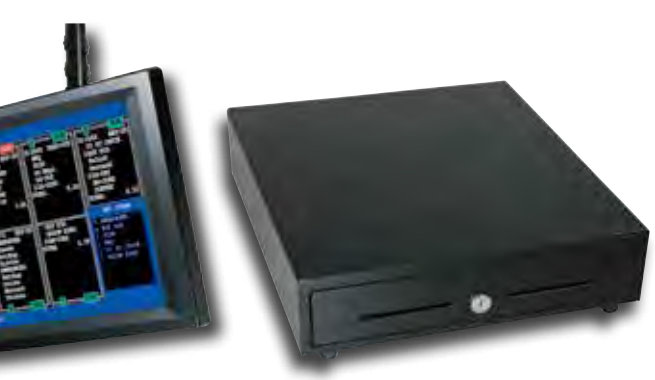
the E-Pad Connect up to eight cash drawers. tem.