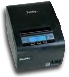
Tabby Embedded The Tabby device is embedded in a highspeed SAM4s Ellix 40 thermal receipt printer.